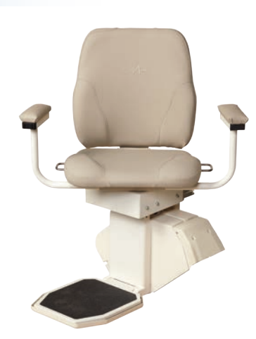
SL600HD with 25" wide seat