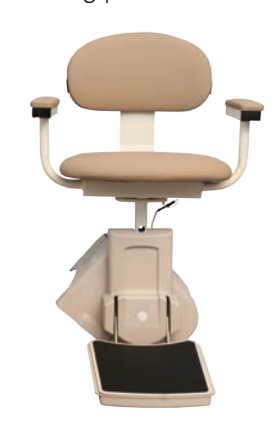
Alpine II Standard Model