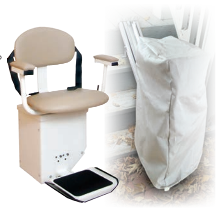
Weatherized Outdoor Model