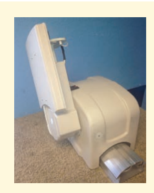
Alpine II is delivered pre-mounted onto a 19" track section for simpler, faster installation