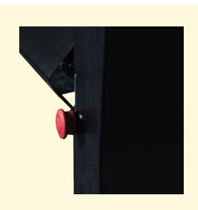
Emergency Stop on the side is easy to reach.