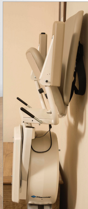
13.6" folded width for more room in your stairwell