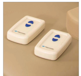
Two easy to use wireless remotes included