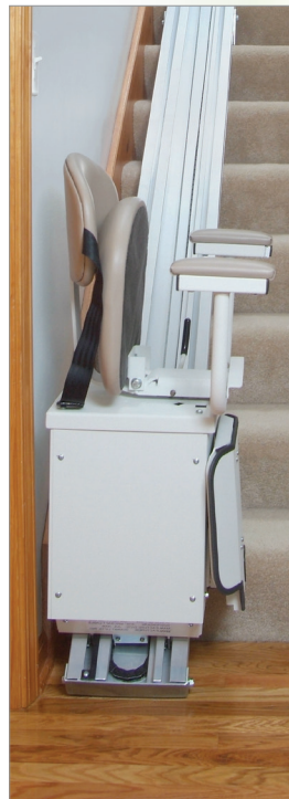
14" width when folded