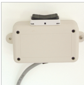
Wall mounted call/send controls