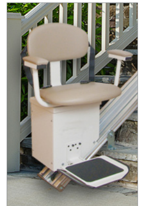
SL350OD includes weatherproof cover