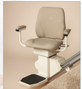
Pinnacle Heavy Duty