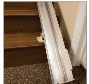
Covered gear rack keeps your stairs clean