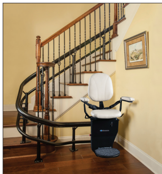
Curved Stair Lifts