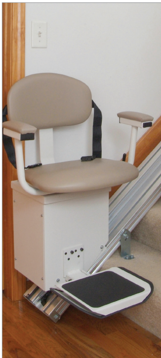
Summit indoor or outdoor