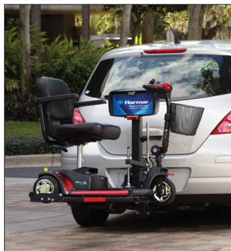
Multiple auto lift solutions for wheelchair or scooter