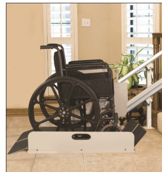
Incline Platform Lifts