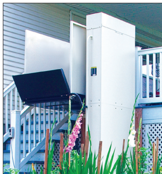
Vertical Platform Lifts